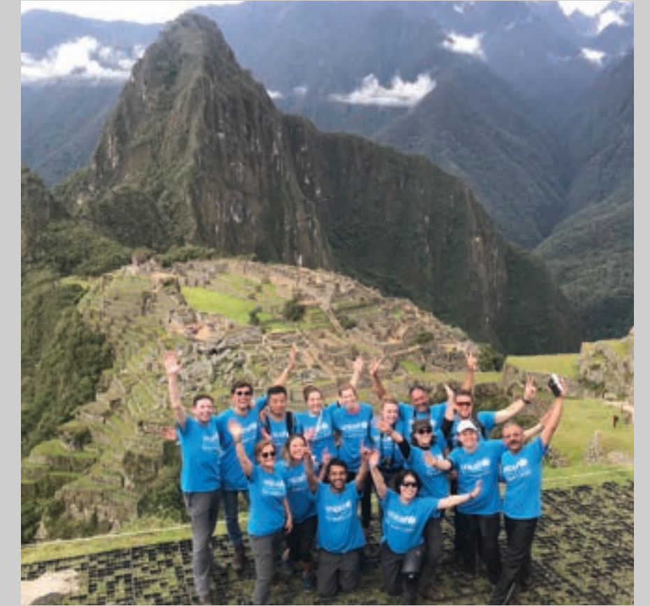
In October 2018, around 80 partners and staff from 30 DLA Piper offices trekked to Machu Picchu to raise USD500,000 for UNICEF's child protection work.