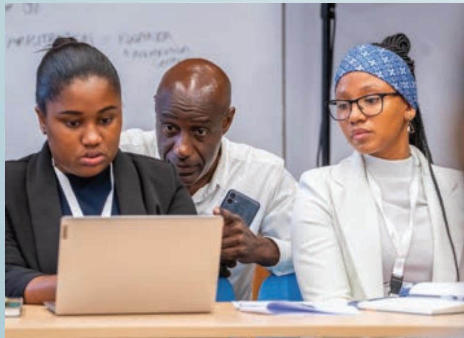
New Perimeter collaborates with the University of Pretoria and the University of Western Cape to teach law students about mechanisms available to policy-makers to attract foreign direct investment and promote human and economic development.

New Perimeter is a nonprofit affiliate of DLA Piper. Created in 2005, New Perimeter harnesses the skills and talents of DLA Piper lawyers to promote a more just world for all.