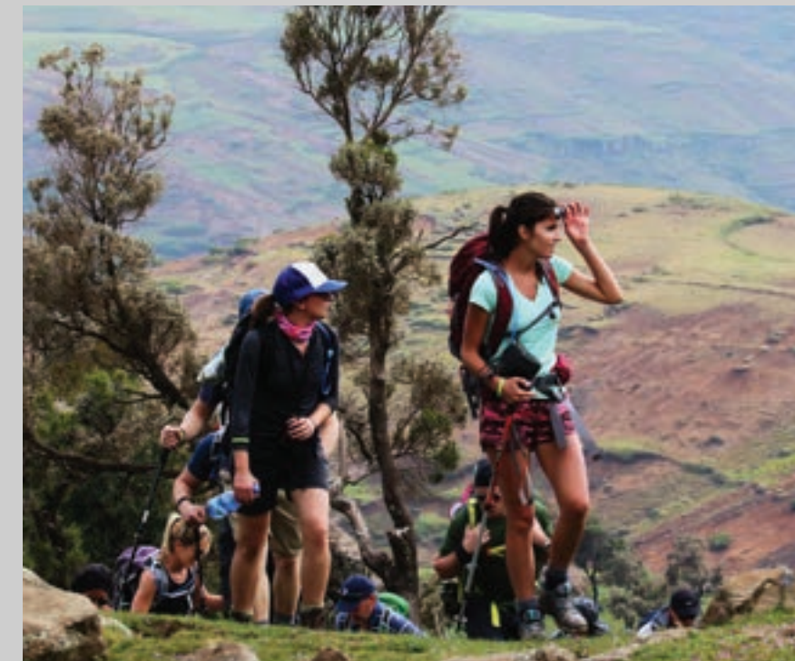
In October 2015, 50 DLA Piper employees trekked through the Simien mountains in Ethiopia, raising GBP140,000 for UNICEF.