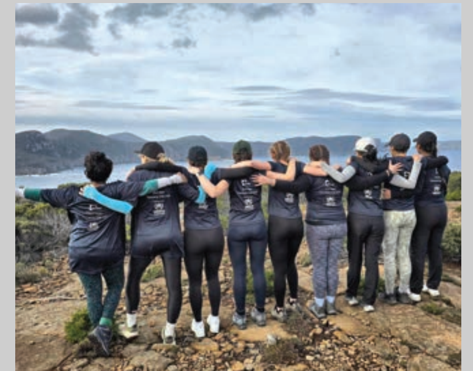
In 2024, DLA Piper employees from Australia and New Zealand trekked through Tasmanian forests to raise AUD200,000 for UNHCR.