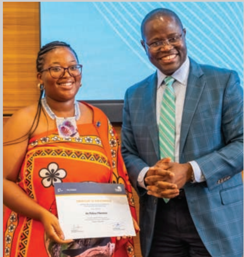
New Perimeter hosts negotiation training for government lawyers from 23 African countries.

New Perimeter and DLA Piper collaborate with Akilah Institute, Davis College, the first women only, nonprofit post-secondary educational institute in Rwanda, to provide training to Rwandan women, including Akilah faculty, students and staff, on identifying, responding to, and combating sexual harassment in society and the workplace.