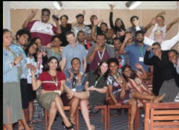
DLA Piper lawyers and law students from the University of the South Pacific

Since 2016, we've supported the Blue Pacific Continent – a group of 15 Pacific Island nations – with their economic, social and environmental development.