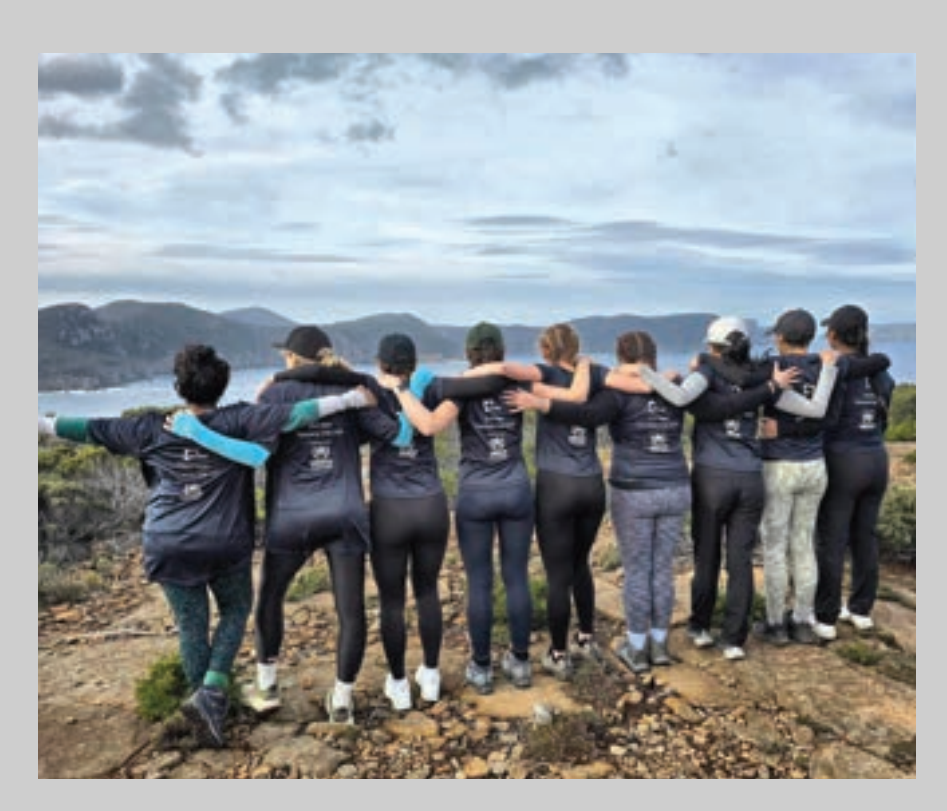
In 2024, DLA Piper employees from Australia and New Zealand trekked through Tasmanian forests to raise AUD200,000 for UNHCR.