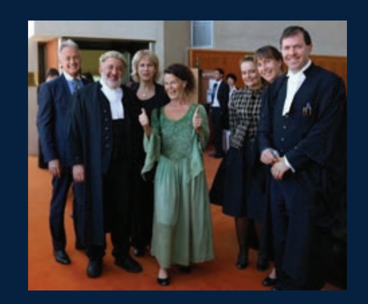
Norrie with DLA Piper legal tean

The decision created an important precedent in law in Australia and the case is now cited in courts around the world.