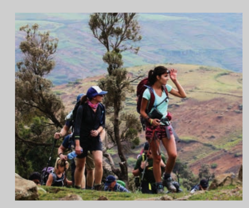
In October 2015, 50 DLA Piper employees trekked through the Simien mountains in Ethiopia, raising GBP140,000 for UNICEF.