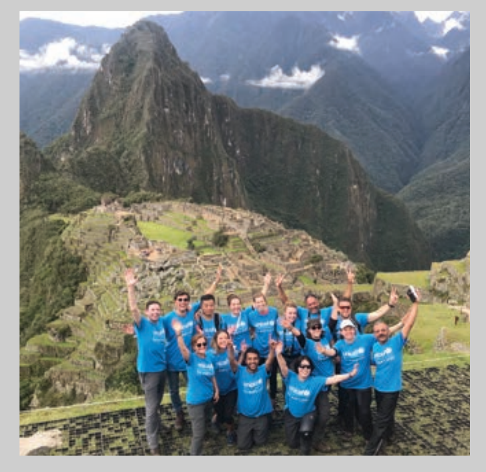
In October 2018, around 80 partners and staff from 30 DLA Piper offices trekked to Machu Picchu to raise USD500,000 for UNICEF's child protection work.