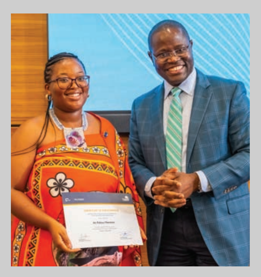
New Perimeter hosts negotiation training for government lawyers from 23 African countries.

New Perimeter and DLA Piper collaborate with Akilah Institute, Davis College, the first women only, nonprofit post-secondary educational institute in Rwanda, to provide training to Rwandan women, including Akilah faculty, students and staff, on identifying, responding to, and combating sexual harassment in society and the workplace.