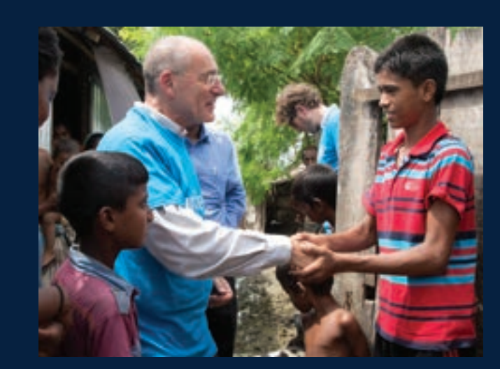
Former DLA Piper Chairperson Tony Angel in Bangladesh with UNICEF

There are more than 60 million children in Bangladesh, and 30 million of them grow up in extreme poverty, increasing the chances of them coming into contact or conflict with the law for crimes such as begging.